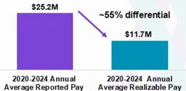
Reported vs. Realizable 1 CEO Annualized Compensation