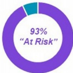
2024 CEO Target Compensation

Incentives that deliver value only if we achieve rigorous performance goals