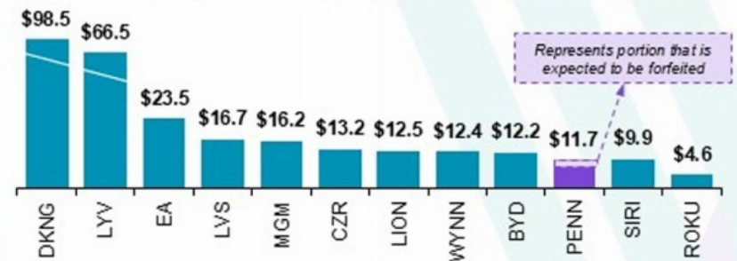
($ in Millions) CEO Annualized Total Realizable 1 Pay (5-Year) PENN CEO in bottom quartile relative to proxy peer group

Incentives that deliver value only if we achieve rigorous performance goals